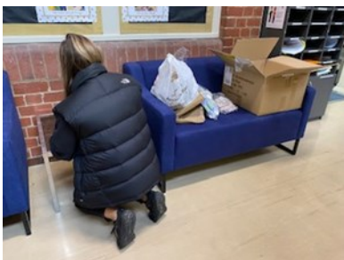
PTA organising Mother's/Special Person's Day

A big thank you to PTA for their dedication and giving up their time for organising events such as the Easter Egg Raffle, Mother's/Special Person's Day and later on in the year, lap-a-thon. A lot of events are fundraisers for our school which go back into the education of your children.